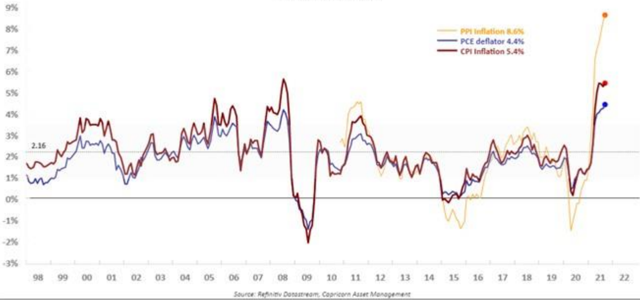
USA Inflation Measures PPI, CPI, PCE, yoy % change